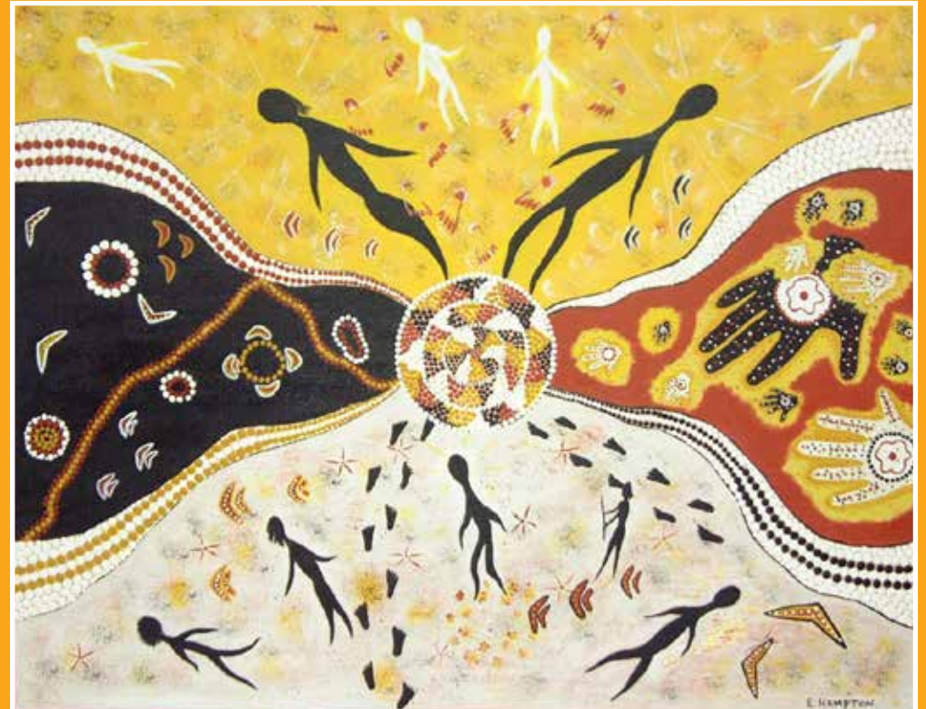
A CLOSE ENCOUNTER - By Eileen Hampton

It is good to have friends who know you, respects you and cares about you when you are sick.